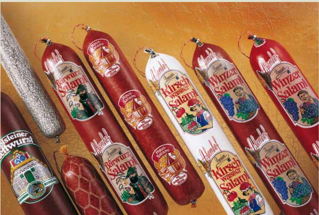
Showing off the contents: apart from a large variety of colours and graphic designs, transparent Walsroder Fibrous Casings are also available.

Walsroder Fibrous Casings offer many different options for enhancing the sausage's visual appeal. Wherever appropriate, the casings are available in mouth-watering colours and designs. Why not take a look ... ?