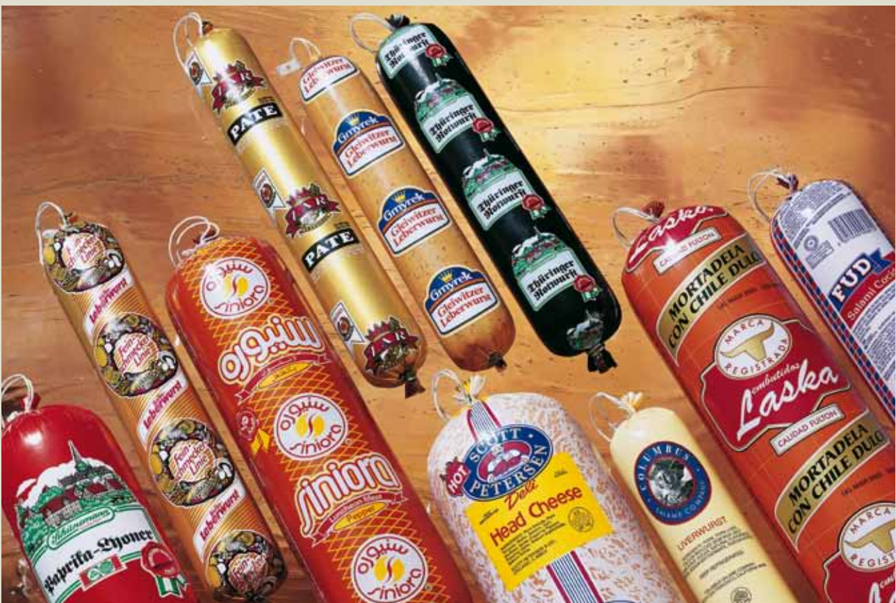
Showing off the contents: the casing colours are suited to the product and can be printed with appealing graphic designs.

Given an appealing exterior, sausages will catch the eye of the consumer. Their inner qualities are carefully protected by the barrier layer, which in the case of Walsroder FVP is on the outside, displaying the sausage's best visual features – smooth, well filled out and with a sparkling finish. The various colours work a treat and well-designed graphics will additionally promote your sausage sales. A good name on the sausage boosts confidence in your product – and printed information helps the consumer make the right purchase decision. This is why sausages in Walsroder FVP are increasingly being supplied with printed designs. Why not take a look ... ?